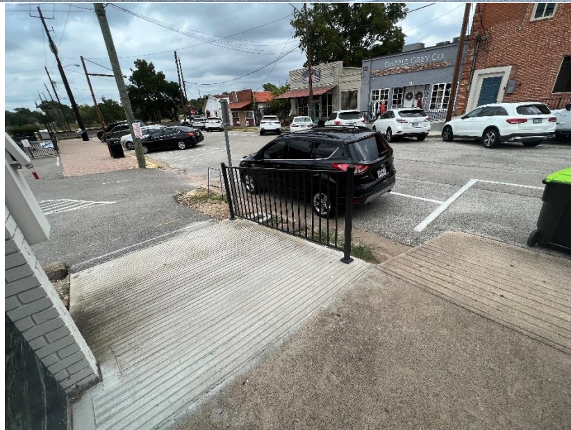
Railing along western Side of 3 rd street.