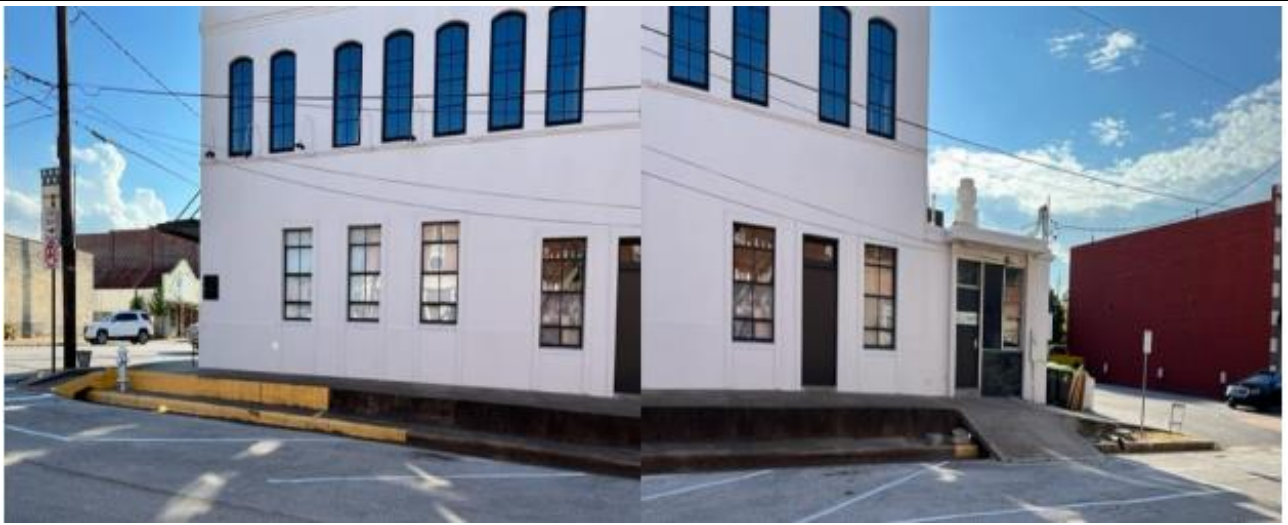
West side of 3 rd Street prior to installation of railing.