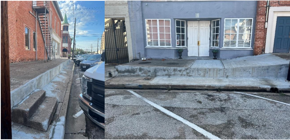
East side of 3 rd Street prior to installation of railing.