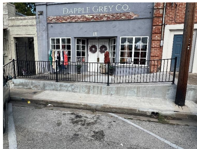
Railing along eastern Side of 3 rd street